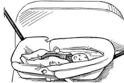
Diagram of Cosco Dream Ride Car Bed: Courtesy of Committee on Injury and Poison Prevention, Pediatrics 1999;104:988-992

Section 11 of the RSSR states that a car bed "...is to be used in a flat position along the vehicle's rear bench seat with the head of the infant towards the centre of the vehicle". In the event of a side impact, an infant in a car bed is, in theory, more vulnerable to injury than an infant in a rear-facing infant seat, especially if the impact is on the side nearest the infant's head (SafetyBeltSafe, 2004). A car bed should only be used as a restraint option if a rear-facing infant seat is not suitable for the infant.